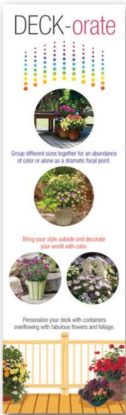
Rack Side Panel